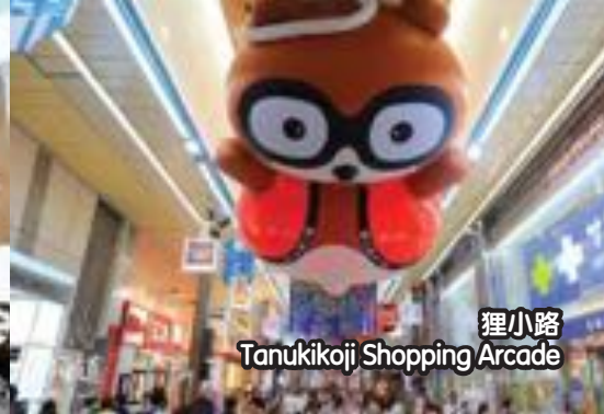
狸小路 Tanukikoji Shopping Arcade