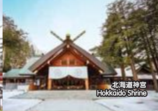
北海道神宫 Hokkaido Shrine