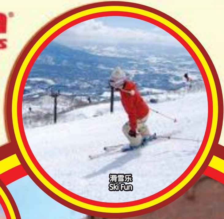
滑雪乐 Ski Fun