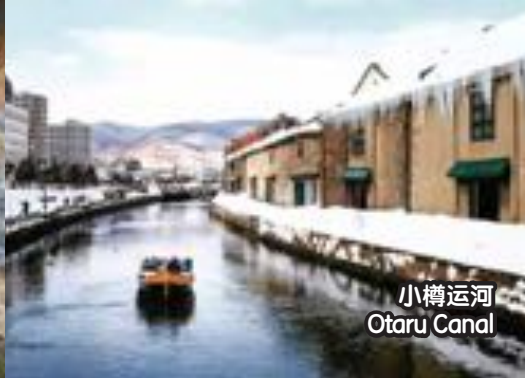
小樽运河 Otaru Canal