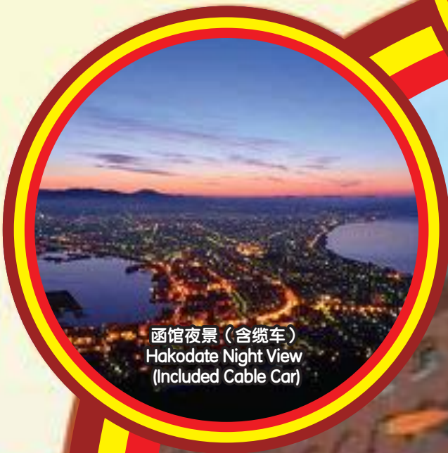
函馆夜景 (含缆车) Hakodate Night View (Included Cable Car)