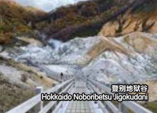
登別地狱谷 Hokkaido Noboribetsu Jigokudani