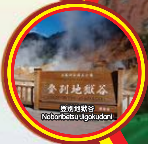
登别地狱谷 Noboribetsu Jigokudani