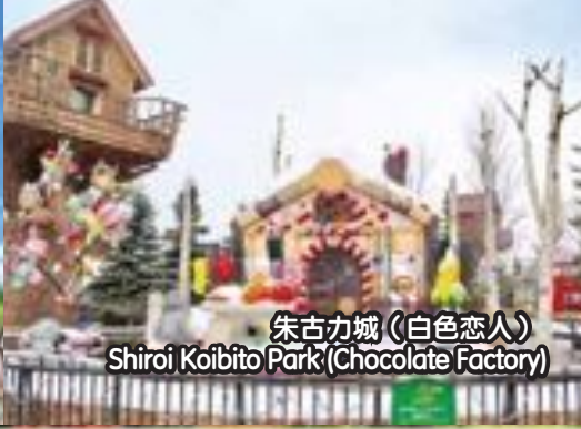
朱古力城 (白色恋人) Shirai Koibito Park (Chocolate Factory)