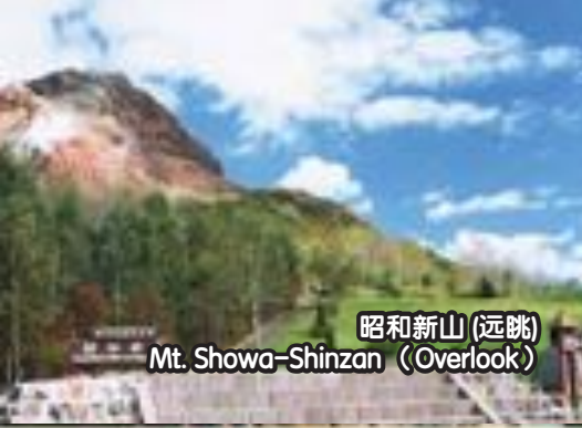
昭和新山 (远眺) Mt. Showa-Shinzan (Overlook)