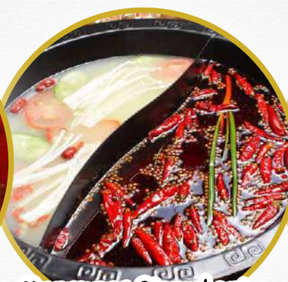
Yuanyang Steamboat 鸳鸯火锅