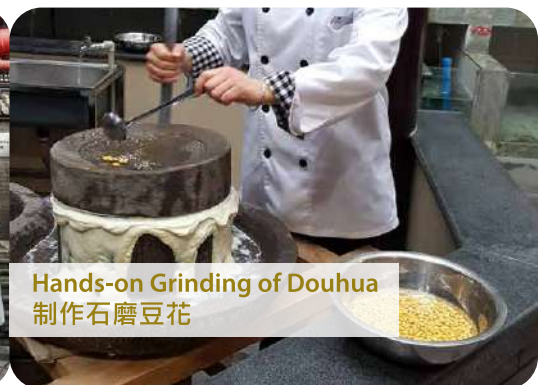
Hands-on Grinding of Douhua 制作石磨豆花