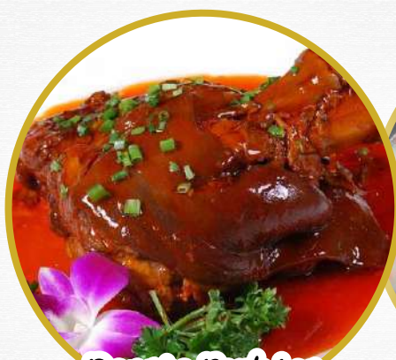
Dongpo Pork Leg 东坡肘子风味