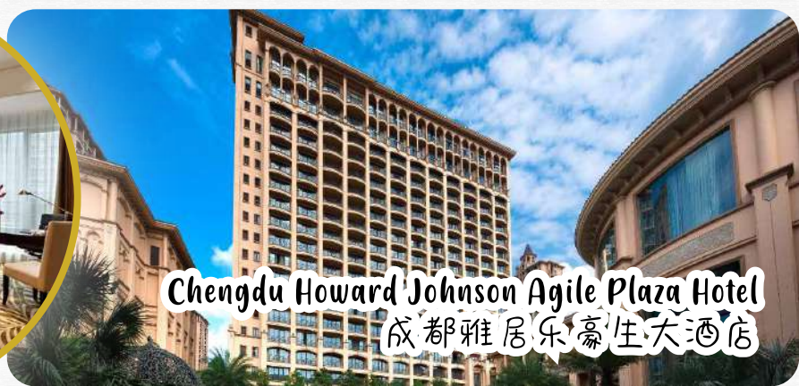
Chengdu Howard Johnson Agile Plaza Hotel 成都雅居乐豪生大酒店

* Picture shown are for illustration purpose only * 照片仅供参考