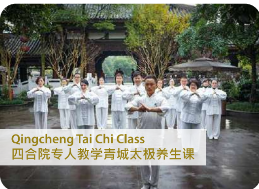
Qingcheng Tai Chi Class 四合院专人教学青城太极养生课