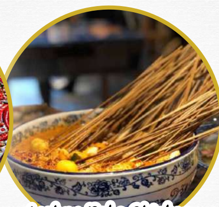
Leshan Bobo Chicken 乐山钵钵鸡