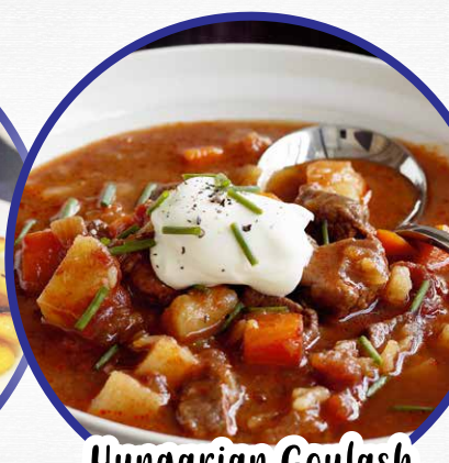
Hungarian Goulash 古雅什汤