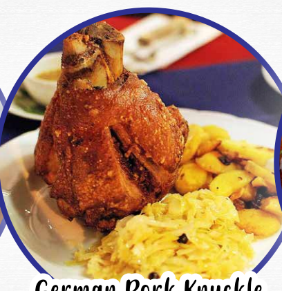
German Pork Knuckle 德国咸猪手