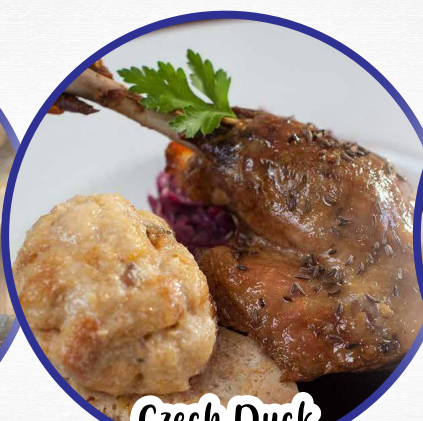
Czech Duck 捷克鸭肉