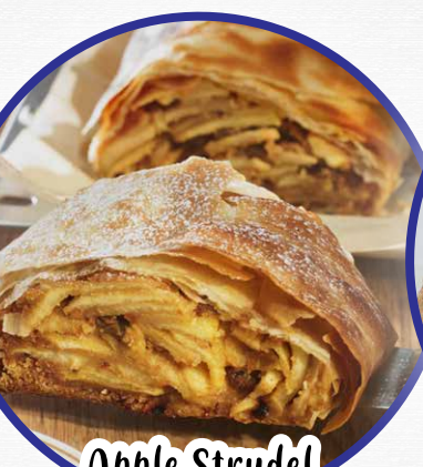
Apple Strudel 苹果卷