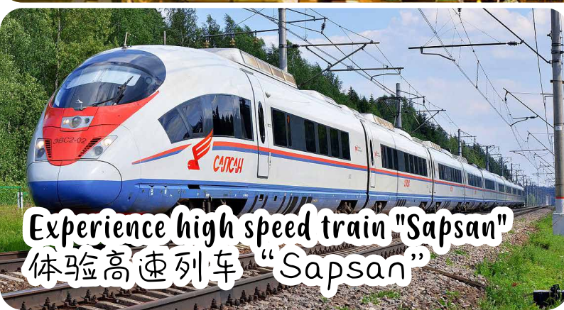
Experience high speed train "Sapsan" 体验高速列车 "Sapsan"