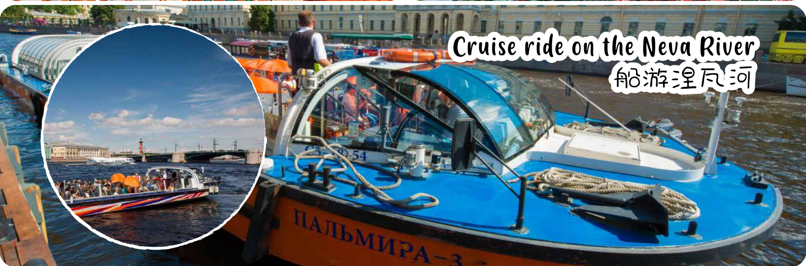
Cruise ride on the Neva River 船游涅瓦河