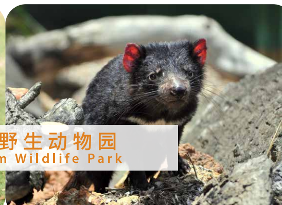
凯维森野生动物园 Caversham Wildlife Park