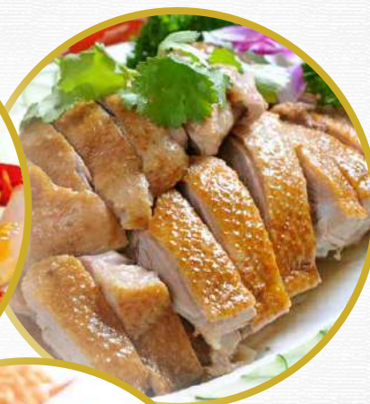
Hainan 4 Dishes 海南四大名菜