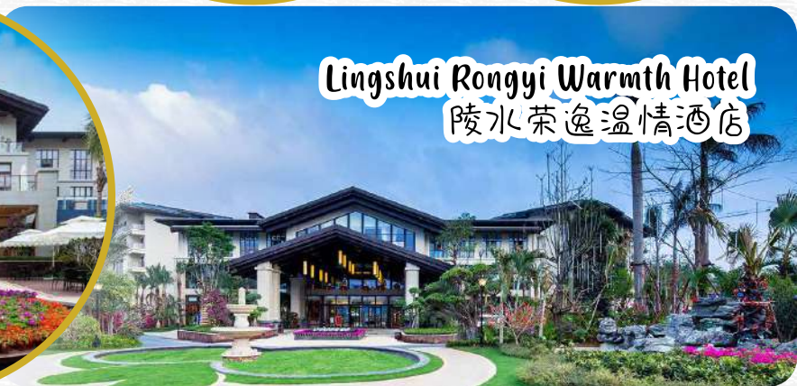
Lingshui Rongyi Warmth Hotel 陵水荣逸温情酒店

* Picture shown are for illustration purpose only * 照片仅供参考