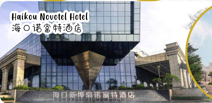
Haikou Novotel Hotel 海口诺富特酒店