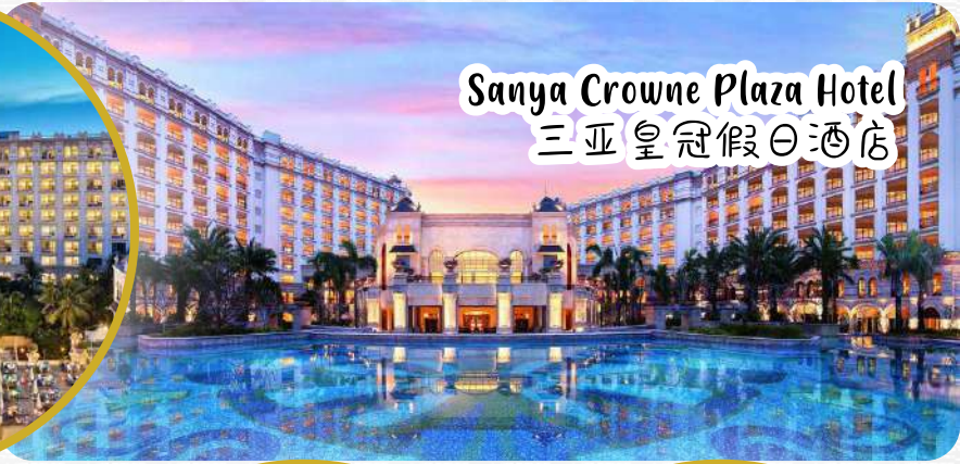
Sanya Crowne Plaza Hotel 三亚皇冠假日酒店