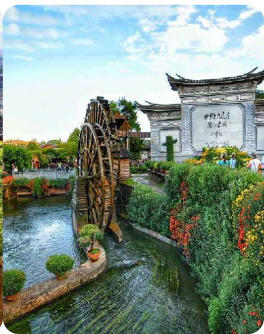
丽江古城 Lijiang Ancient Town