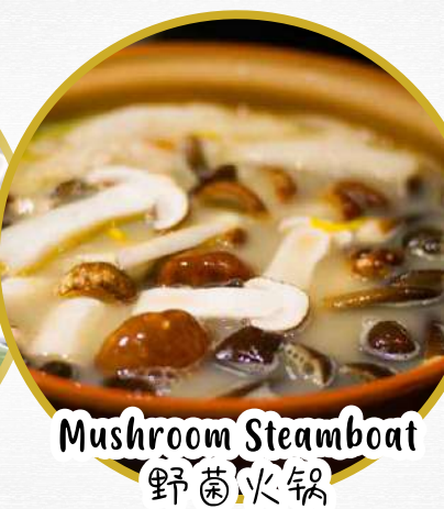
Mushroom Steamboat 野菌火锅

* Picture shown are for illustration purpose only * 照片仅供参考