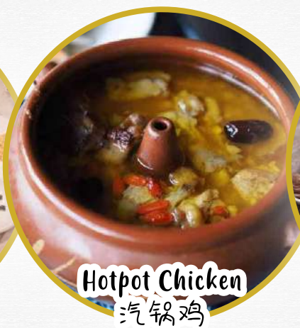
Hotpot Chicken 汽锅鸡