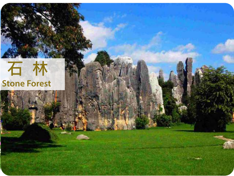
黑石林 Black Stone Forest