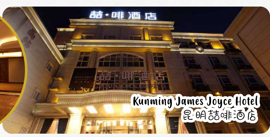
Kunming James Joyce Hotel 昆明喆啡酒店

* Picture shown are for illustration purpose only * 照片仅供参考