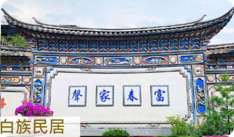
喜洲白族民居 Xizhou Bai Ethnic Houses