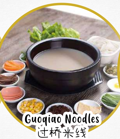
Guoqiao Noodles 过桥米线