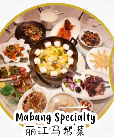
Mabang Specialty 丽江马帮菜