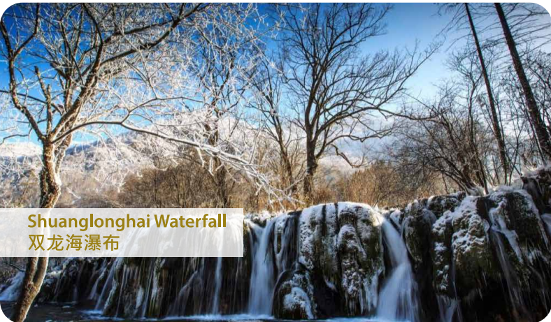
Shuanglonghai Waterfall 双龙海瀑布