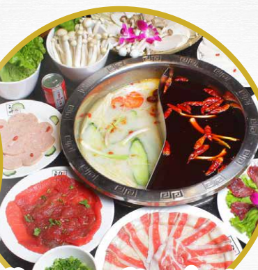
Yuanyang Steamboat 鸳鸯火锅