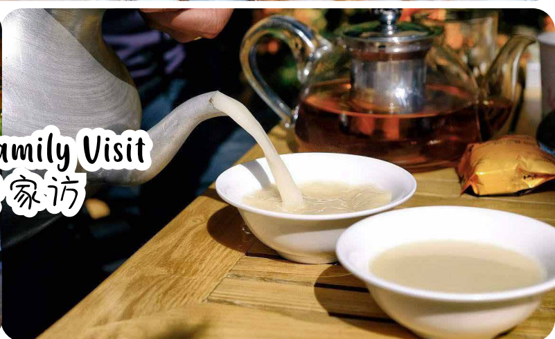
Tibetan Family Visit 藏民家访