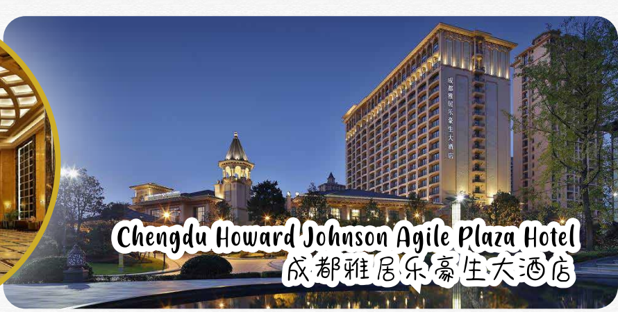
Chengdu Howard Johnson Agile Plaza Hotel 成都雅居乐豪生大酒店

* Picture shown are for illustration purpose only * 照片仅供参考