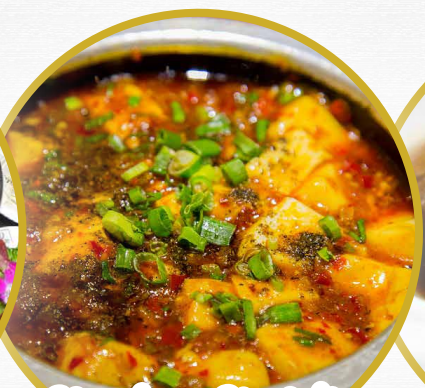
Qingcheng Specialty 青城风味