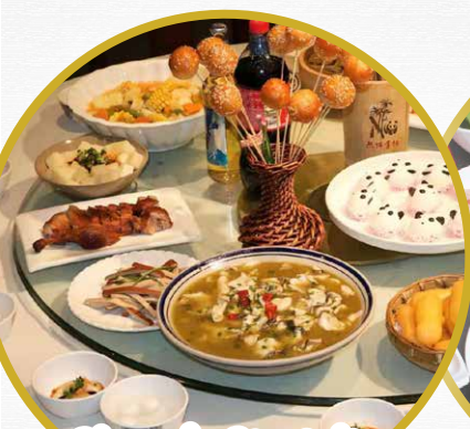
Chengdu Specialty 成都小吃