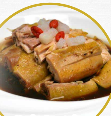
Herbs Specialty 药膳风味

* Picture shown are for illustration purpose only * 照片仅供参考