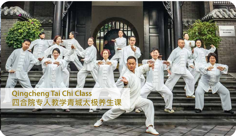
Qingcheng Tai Chi Class 四合院专人教学青城太极养生课