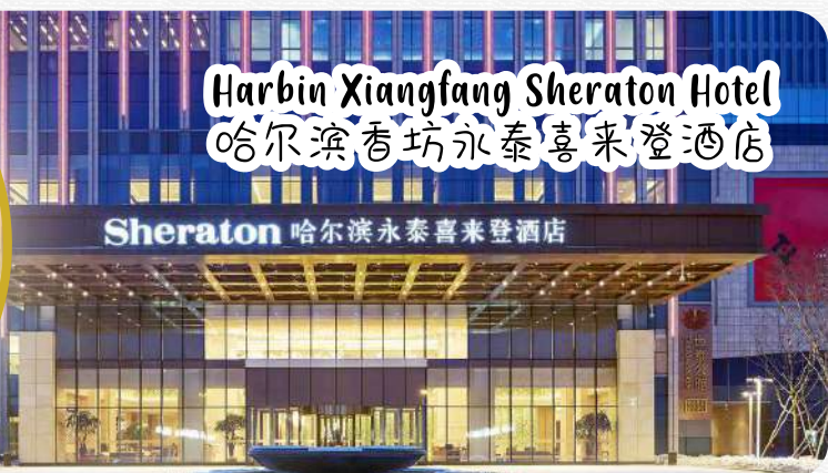
Harbin Xiangfang Sheraton Hotel 哈尔滨香坊永泰喜来登酒店