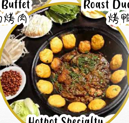
Hotpot Specialty 特色铁锅炖