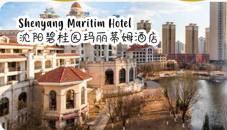
Shenyang Maritim Hotel 沈阳碧桂园玛丽蒂姆酒店