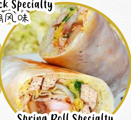
Spring Roll Specialty 春饼风味

* Picture shown are for illustration purpose only * 照片仅供参考