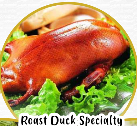
Roast Duck Specialty 烤鸭风味