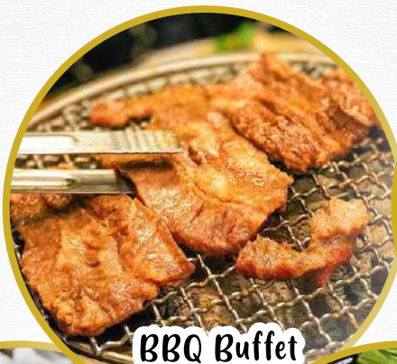
BBQ Buffet 自助烤肉