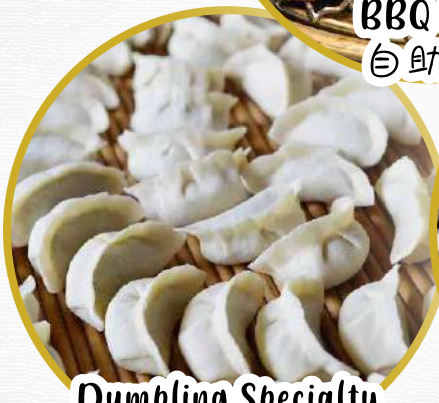
Dumpling Specialty 东方饺子宴