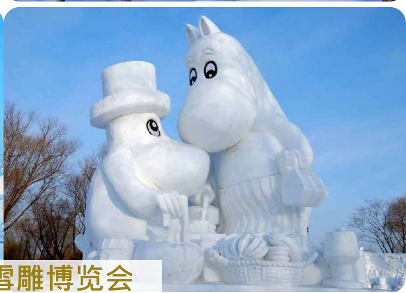
太阳岛雪雕博览会 Sun Island Snow Sculpture Art Expo