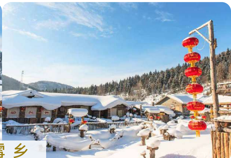
雪乡 Snow Village