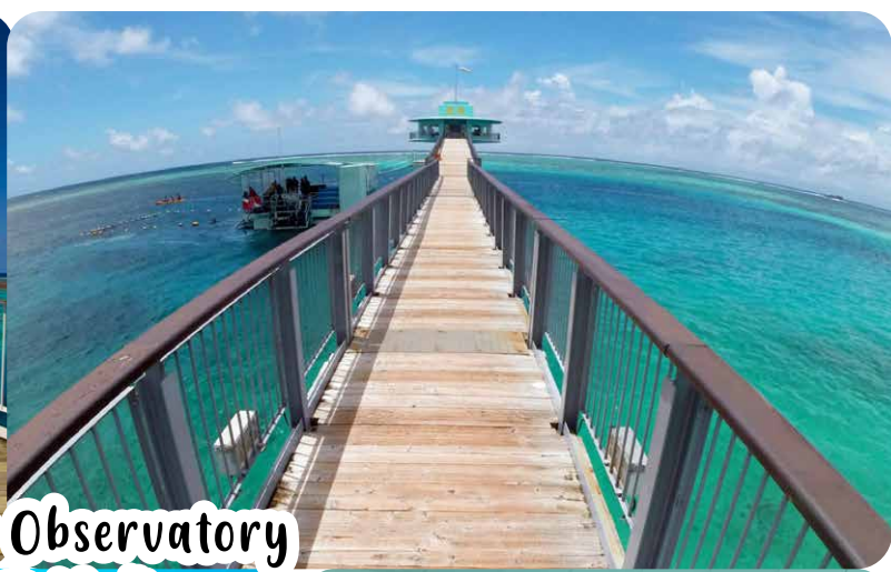
Underwater Observatory 海底瞭望塔