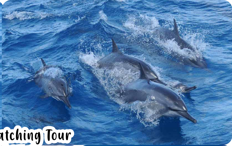
Dolphin Watching Tour 观赏海豚团