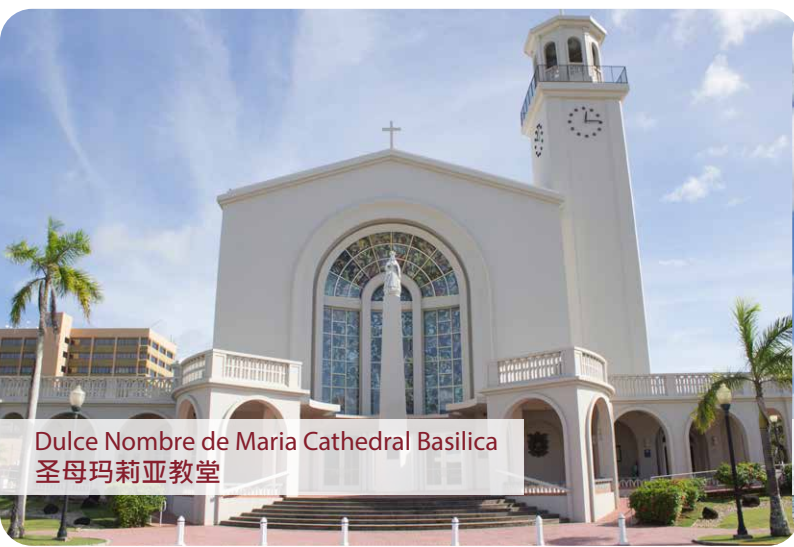
Dulce Nombre de Maria Cathedral Basilica 圣母玛莉亚教堂