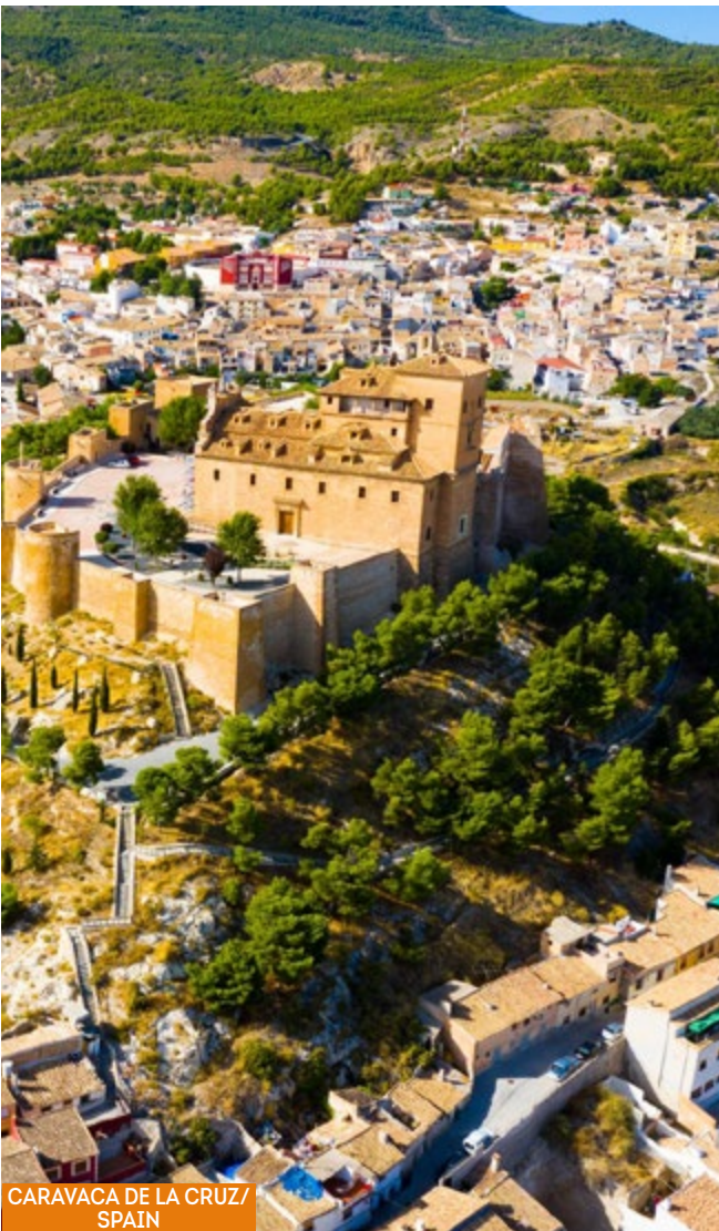
CARAVACA DE LA CRUZ SPAIN